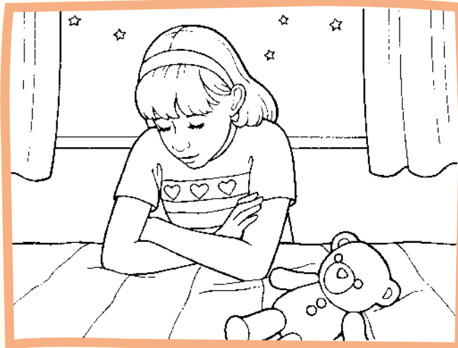
4. I can talk to Heavenly Father in prayer, and He will answer me.