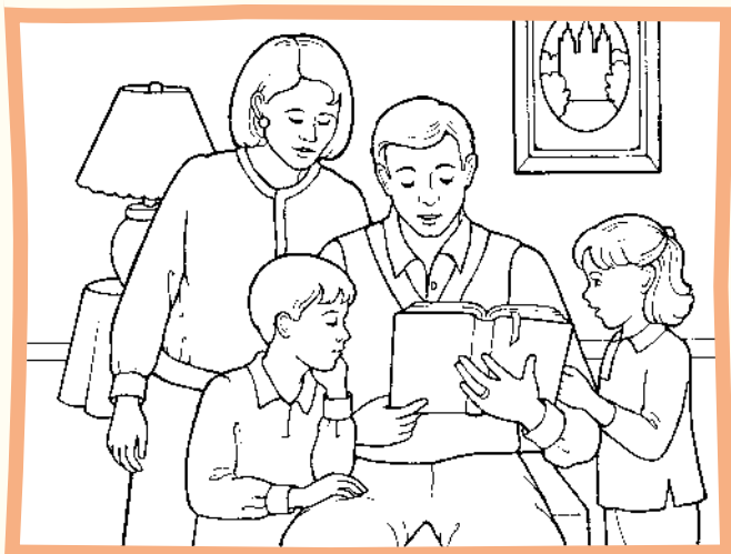
3. Heavenly Father asked special people to help me and guide me.